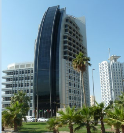
Al Seef Kuwait