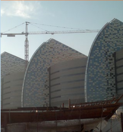
Sidra Hospital Doha