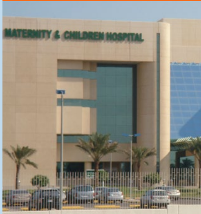
Maternity and Children Hospital Dammam