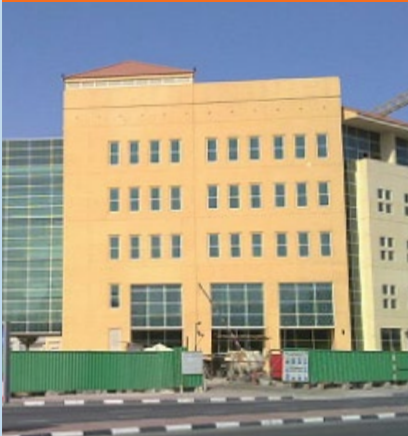
Healthcare City Dubai