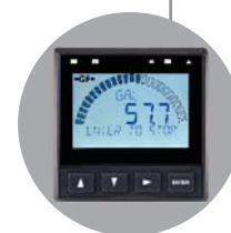
9900-1BC Batch Controller