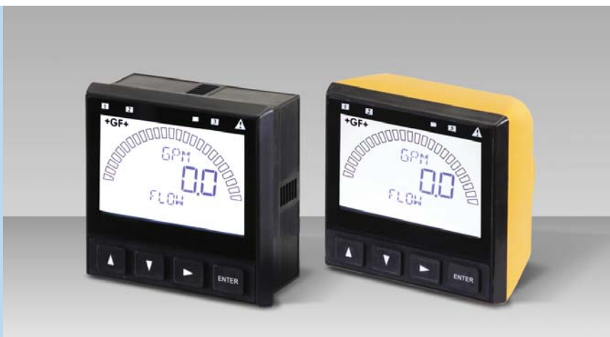
9900 Transmitter – Panel and Field Mount

As a new member of the Signet SmartPro™ family of instruments, the Signet 9900 Transmitter provides a single channel interface for many different parameters including Flow, pH/ORP, Conductivity/Resistivity, Salinity, Temperature, Pressure, Level and other sensors that output a 4 to 20 mA signal. The 9900 Transmitter (Generation II) has the added capability of supporting the Batch Module for batching control.